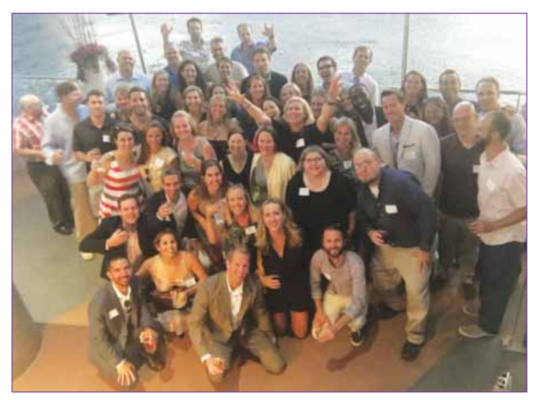
Class of 1996 celebrates 20 years