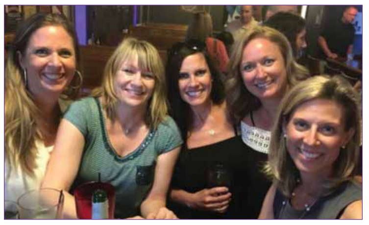
Class of 1991 gathers at the Blue Dog Tavern