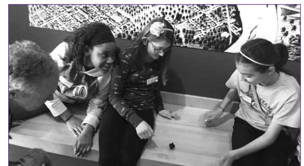
Sixth graders enjoy viewing the King Tut exhibit at the Grand Rapids Public Museum